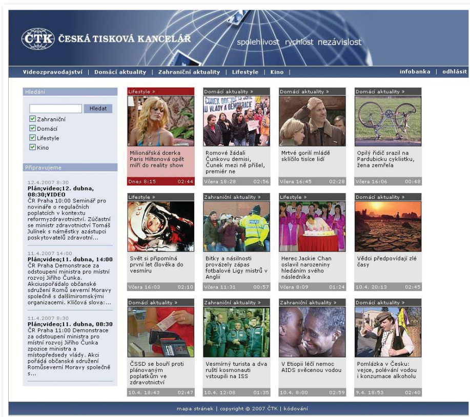
The new look of the ČTK Videobank gives visitors a quicker overview of content.

Access to the videobank is available to all ČTK clients who receive news reports through one of our business models. It is clear at first glance that the new format offers more information from a longer period of time. A brief animation of the report in the individual reports’ windows